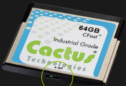
Physical Write Protect Switches